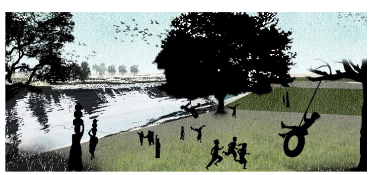
6. LOCUS OF ALL COMMUNITY ACTIVITIES -THE RECREATIONAL AREAS